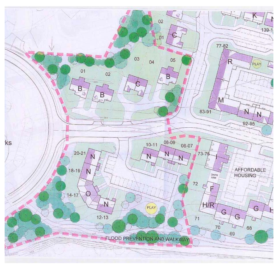
Fig. 8 : Layout of proposed site (edged red)

where it would ultimately allow for linkages into the existing network of pathways in the Milton Wood area and beyond that to connect with the Aviemore Orbital footpath.