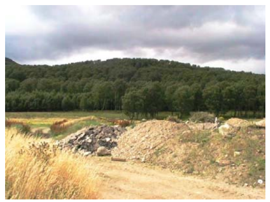
Fig. 3: Western area of proposed site (looking west towards A9)

2. Permission is sought for 21 dwelling units, consisting of a mix of detached and semi detached dwelling houses, together with flats arranged on upper and ground floors within groups of two storey terraced properties. The dwelling houses are separated from the apartment units by the main access road running through the site in a