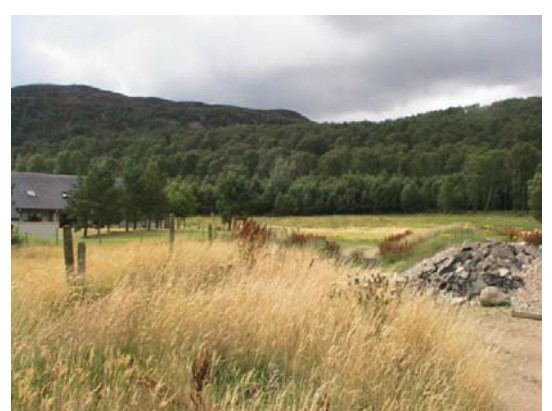
Fig. 2 : Proposed site - looking westwards (Scandanivian Timeshare Village visible to left)

1. Full permission is sought in this application for the erection of 21 houses, associated infrastructure and landscaping. The subject site is located on land to the north of Aviemore Highland Resort. The site is bounded to the west by the Scandinavian Timeshare Village and to the north by a large area of open ground which is the subject of a current application by the same applicants (Tulloch Homes (Aviemore) Ltd., in which permission is being sought for approval of reserved matters for 140 dwelling units - CNPA planning ref. no. 05/306/CP refers). The eastern boundary of the subject site is formed by the Aviemore Burn with a partially cleared area beyond that being the site of a proposed supermarket (CNPA planning ref. no. 04/120/CP refers). The southern boundary of the site is formed by the existing internal access road through the Aviemore Highland Resort (AHR) with a large area of hard surfacing beyond that which is described on site plans as a 'temporary Much of the subject site is currently dominated by the temporary presence of mounded earth and spoil heaps which were transferred to the land following clearance of other sites in the vicinity.